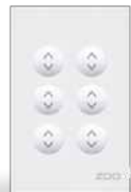
6 key control switch

Turn off lights from the shopping centre or the hair straightener that you left on from work with the simple touch of a button!